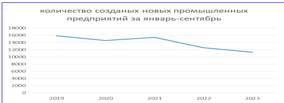
Figure 1. Dynamics of new industrial enterprises created in January-September 2023

According to the obtained data and analysis of the Business Activity Index (IDA) in October 2022, calculated by the Center for Economic Research and Reforms, it amounted to 1022 points, and, compared to the previous month, it increased moderately by 2.2%. There is also a 9% increase in IDA compared to the same period last year.